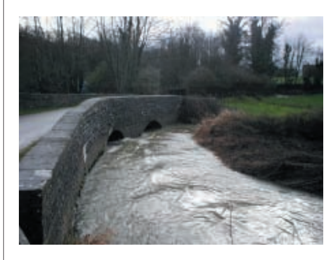
Lower Coln Valley

The Lower Coln Valley Character Area extends from the village of Coln Rogers south-eastwards to Coln St Aldwyns and Hatherop, and includes a small tributary valley that extends north-eastwards from Ablington Downs to Calcot Peak Farm. In common with the Middle Coln Valley, the course of the Coln continues to flow across the White Limestone of the Great Oolite. As a consequence of the river erosion through the Oolitic Limestone series, limited exposures of the Forest Marble Formation in the south of the character area occur on the west side of the river valley.