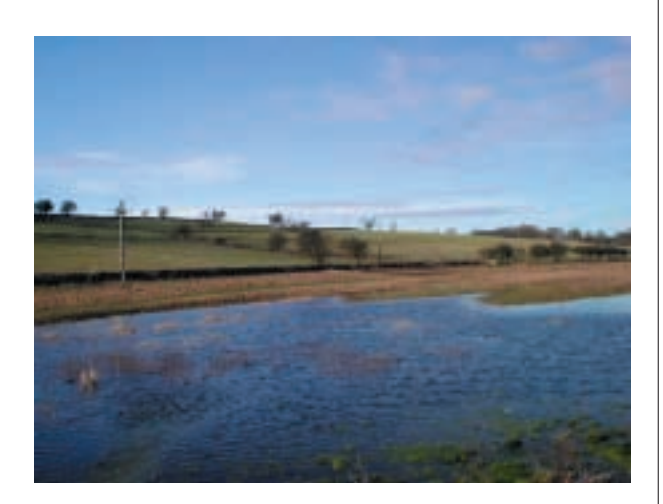
10C Upper / Middle Leach Valley

The River Leach rises from a series of springs in the village green of the small village of Hampnett, which is set in the bowl of an enclosed valley. Although extending for a short section into the High Wold landscape type, this Upper / Middle reach of the river has been considered as part of the sequence of High Wold Dip-Slope valleys. In common with the Churn and Coln, the river flows across the White Limestone Formation of the Great Oolite Group. Alluvial deposits also occur along the valley bottom.