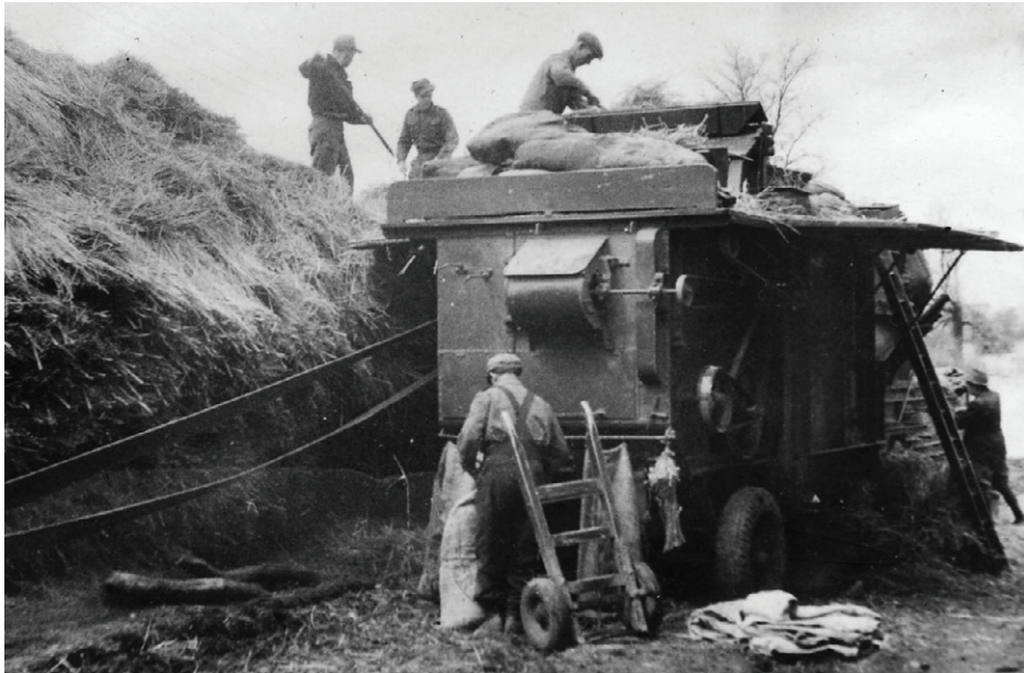
Farm labourers and Italian POWs bringing in hay on Greystones Farm during the Second World War.

photograph shows farm labourers and POWs bringing hay to the barn that stood here. The hay fed livestock over winter.