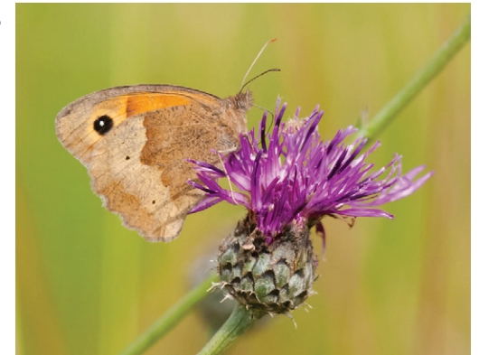
A Meadow Brown butterfly feeds on the nectar of knapweed.

The Moors is divided into narrow strip fields bounded by double-ditched hedges, each planted along a central causeway that runs to the river. Were they drains or routes to access the river?