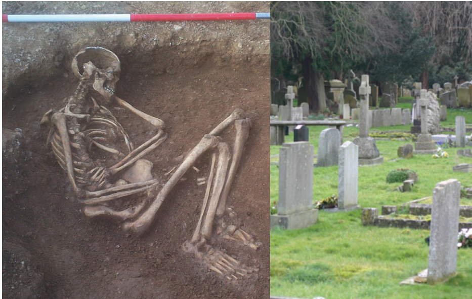
Left: an Iron Age burial in the oppidum. Right: Bourton Cemetery.

This public cemetery dates from 1888 when St Lawrence Church closed its graveyard in the village. It is on the site of a smaller Baptist cemetery dating to 1701. It is located inside the Iron Age oppidum. The cemetery moved burials to outside the village, creating a distance between where people were buried and where they lived. This was typical of Victorian preferences, which evolved as church graveyards filled up and were prone to outbreaks of infectious disease.