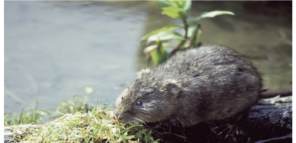
Water voles thrive in the slow-moving waters of the River Eye.

Today, the river supports many plants and animals, as habitat and food source. Rushes, reeds and other marginal water plants grow along its edges. It is home to mayflies, freshwater shrimp, water voles and otters. Kingfishers and damselflies skim along it, catching fish and insects respectively. Stand here for a while and see what you can spot.