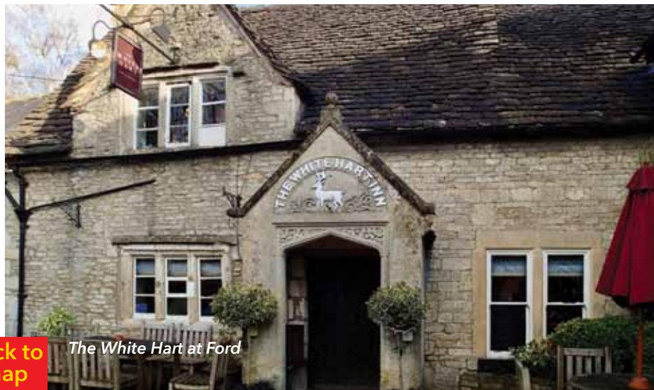
The White Hart at Ford