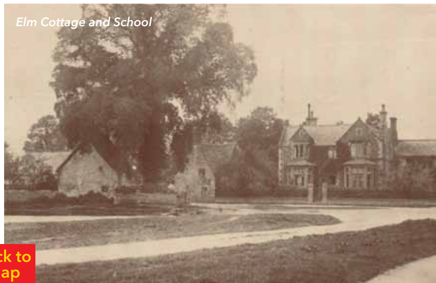
Elm Cottage and School