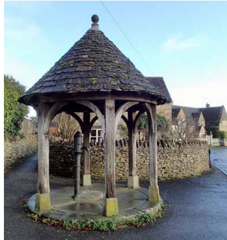
Wellhead and Village Pump