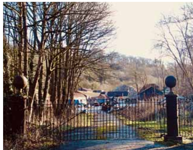
Slaughterford Mill (Chapps Mill)