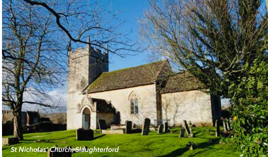
St Nicholas' Church, Slaughterford