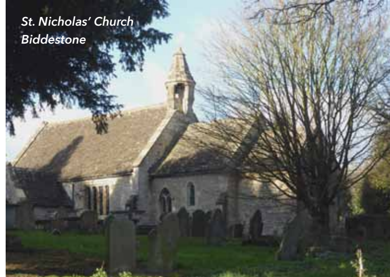
St. Nicholas' Church Biddestone

There are magnificent views of Slaughterford village, St. Nicholas' Church, the Brewery, By Brook valley and out towards Colerne Down.