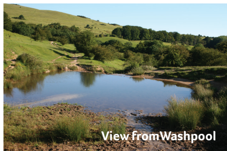
View from Washpool

From here retrace your steps via the Washpool to the stile you ignored earlier and turn right over this stile (3). Follow the path downhill through a field, passing a horse arena on your right, then go over a stile.