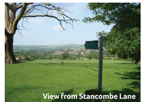
View from Stancombe Lane

Turn right onto the lane and then immediate left through a gate into a field, crossing it to the far side to a large sign 'PATH'. Go through the gate and turn right towards another large sign 'PATH'. Head to the left of the farm buildings to leave the field via a gate slightly hidden from view.