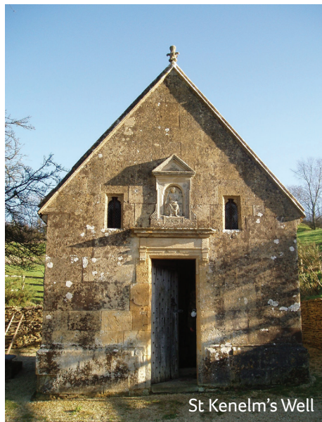
St Kenelm's Well