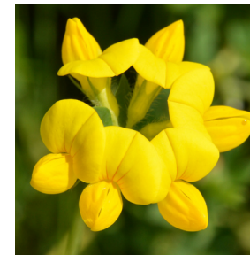
Bird's-foot trefoil

Newbridge Slopes is managed by Avon Wildlife Trust and is a wonderful mix of limestone grassland and woodland. In the meadows you can find wildflowers such as salad burnet, yarrow, woolly thistle and bird's-foot trefoil.