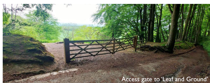
Access gate to 'Leaf and Ground'

old coach road from the Vale. The mounting stone 3 immediately when changing horses at the top of the climb. Turn right along the stone track for approximately 200m then bear left towards Stinchcombe Hill House on your left. Pass in front of the entrance to the house.