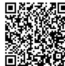
Jane Austen's world – Beechen Cliff.

In addition to the Circuit of Bath the scheme promotes a range of shorter local walks, runs the annual Bathscape Walking Festival each September and a series of weekly walks throughout the year.