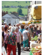
Off to market