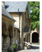
Nailsworth's train station is now a private house

See more about Stroud Market on the next page