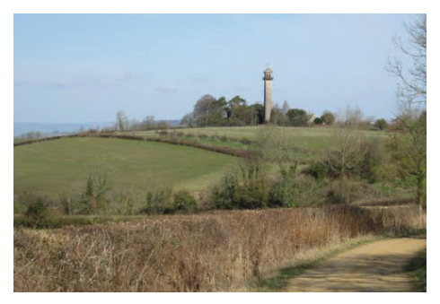
Passing through the gate, turn left and follow the blue public bridleway sign, keeping the fence on your left. This path can be muddy in the winter. Continue through the next gate, following the bridleway across the fields towards the barn in the distance. Passing through a gate, you will rejoin the road (4).

On reaching the monument turn right along the track. This is the Cotswold Way and you follow this for for about half a mile, before turning left at the Cotswold Way sign. This takes you down through a field to a wooden kissing gate (3).