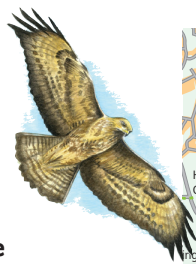
Figure of Eight: Eastern Loop