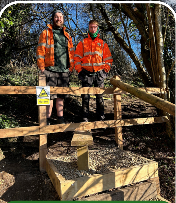
Site 1 after: New fencing, steps, stile and handrail

Local contractors have made a start on site restorations with a new stile (pictured) going in, as well as a new pedestrian gate...and there are no signs of slowing down! All works on the footpaths is estimated to be completed in the next 1-2 months to be followed by a celebratory 'Village Community Walk' in April.