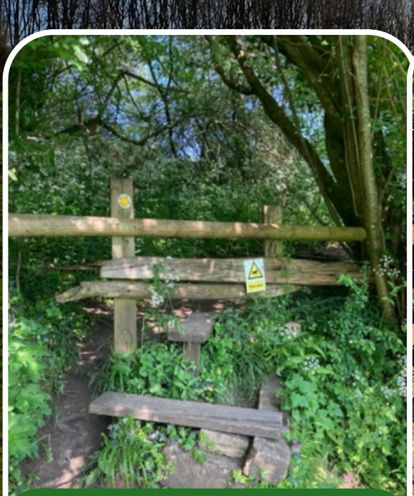
Site 1 before: Unstable steps, degraded stile, overgrown

We were pleased to support this initiative in our most recent funding round with a £2,500 grant.