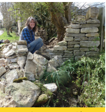
A Sevenhampton resident cheerfully takes on the job of rebuilding the dry stone wall outside her house.