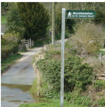
If you can manage one stile, this sign at point soffers a pretty path back to the start via the church.