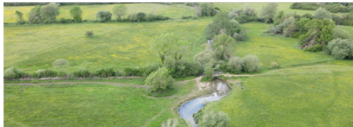
Part of the meadows forming Greystones Farm Nature Reserve