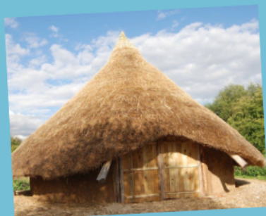
Iron Age Roundhouse

The reserve is managed by Gloucestershire Wildlife Trust. Here, you can visit the Discovery Barn at the farm buildings which has displays about the history and wildlife on the site. Check opening hours.