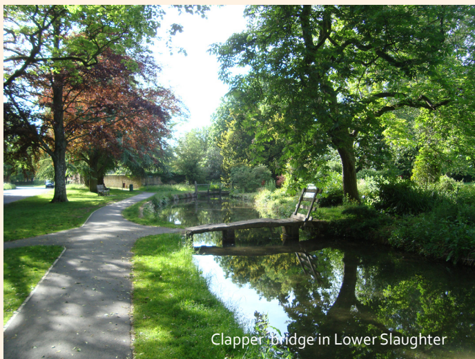
Clapper bridge in Lower Slaughter

At the road turn left and in 150m arrive at the war memorial.